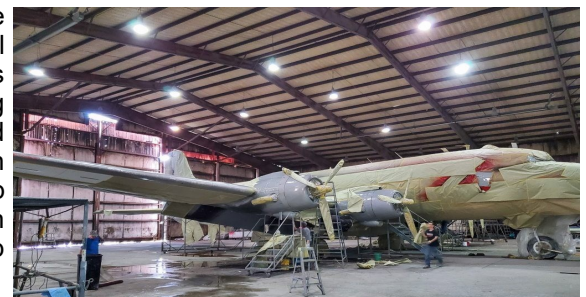
C-54D 43-17228 "SPIRIT OF FREEDOM" BEING EXPERTLY PAINTED AT CRIDER AIRCRAFT PAINTING, INC. MENA, AR.