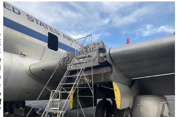
THE #2 POSITION OF C-97G "ANGEL OF DELIVERANCE" AWAITS A REPLACEMENT R4360-59B.

Tragedy struck on June 4, 2019 with the catastrophic # 2 engine failure on our C-97 followed by the Covid Pandemic then the loss of our C-54E in early 2020. All of these combined hardships temporarily derailed the C-97 program until now. Now we need those tough, stubborn, "never give up" type C-97 supporters to join our ranks and help make it happen. All our C-97G needs to get airborne again is a current inspection and an airworthy engine. Together as a team, we can make this happen. Please see the enclosed C-97 insert page to learn more how you can help to save the world's only viable C-97 and keep it flying on its mission of history, education, and remembrance about the great Berlin Airlift of 1948 and 1949 and to honor those who served.