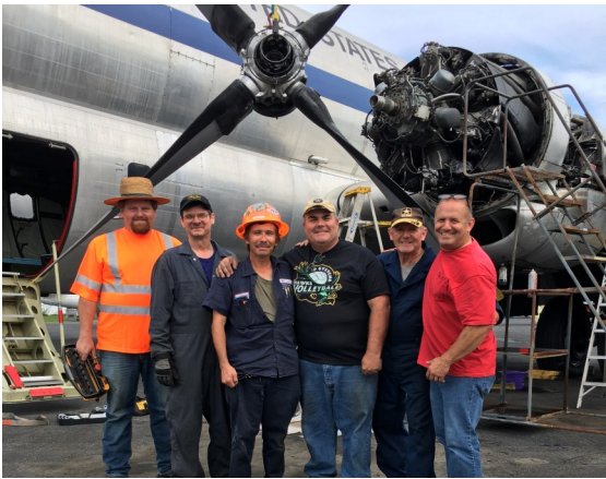
THE CREW POSING IN FRONT OF THE #2 ENGINE OF THE "ANGEL OF DELIVERANCE" DURING THE PROCESS OF REMOVING IT ON SEPTEMBER 25, 2021.

The Berlin Airlift Historical Foundation acquired our very rare Boeing C-97G from the Grace Air Medical Foundation all the way back in April of 1996. Since that time, getting our C-97 airworthy and flying was a very difficult and time consuming crusade that resulted in triumph on November 17, 2017. On that day, our beautiful and rare Boeing C-97G took to the skies proving that we have what it takes to get a C-97 in the air. We, as an organization, learned a lot during those years as we gained valuable experience about this great unsung hero transport of the Berlin Airlift and the Cold War era as an air to air refueler. Now that we have acquired an abundance of spare parts, the remaining resource needed are those special kind of people who also share the same visions; to hear the power of the mighty P&W R-4360 Wasp Major engines and to keep the world's last viable C-97 flying and be willing to support our needs. Back in June of 2019, operating our C-97 was beginning to progress from the crawling stage to a walking stage. We had several C-97 events scheduled for 2019 and 2020, many of them at Military bases with many others seeking more information.