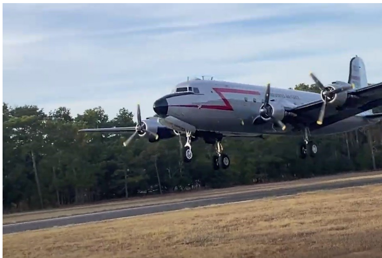
C-54D "SPIRIT OF FREEDOM" LIFTS OFF FROM THE RUNWAY AT FIRST FLIGHT AIRPORT IN KILL DEVIL HILLS, NC ON DECEMBER 17, 2021.

While heavy demands, finances and time were always our enemy during the past 18 months, we are happy to report that we did manage to participate in 4 events in 2021. The income received from these 4 events was greatly needed and appreciated. The first event was in Waynesburg, Pennsylvania which included a static display, a candy drop and a plane pull! This event happened before the airplane went to the paint shop in Mena, Arkansas. The first event after receiving the new 60th Troop Carrier livery was at Sparta, Tennessee, along the way back east from Arkansas. The next event was at Monroe, North Carolina, and the last was our annual visit to the Dare County Regional Airport near Manteo, NC.