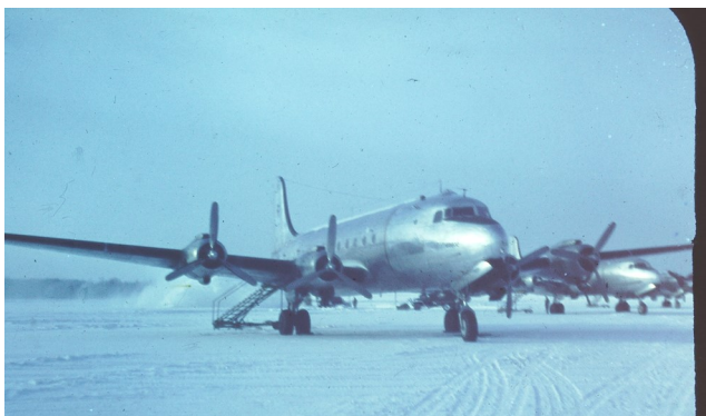
THREE SNOWY DOUGLAS C-54's