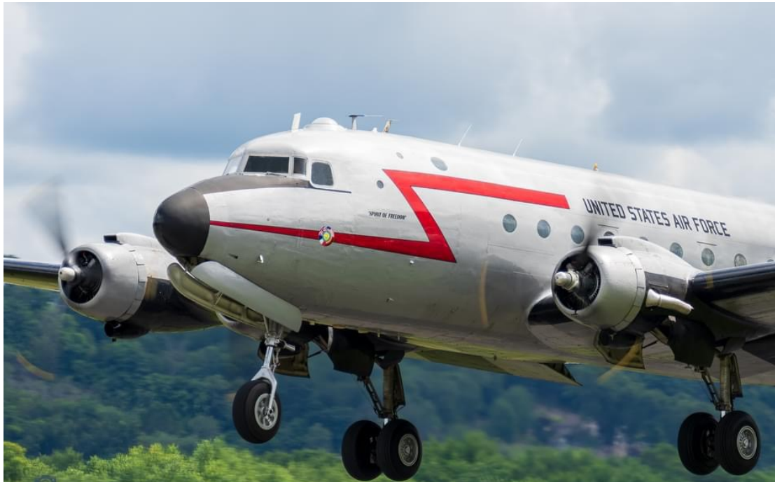
C-54D "Spirit of Freedom" taking off from Lock Haven, PA in June 2024