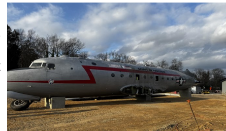
CLIPPED WINGS: THE FUSELAGE OF C-54E "SPIRIT OF FREEDOM" SITS IN WAITING FOR ITS NEW LIFE AT AVIATOR BREWERY IN FUQUAY VARINA, NC.