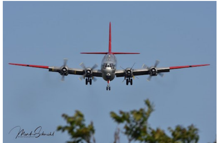
BOEING C-97G "ANGEL OF DELIVERANCE" PERFORMING A 3 ENGINE LANDING AT READING, PA IN JUNE OF 2019.

If you recall, in the later months of 2021, the BAHF organization acquired a complete, in tact, Boeing C-97G in Greybull, Wyoming to be used as a parts airplane to solve our replacement engine problem for our C-97G the "Angel of Deliverance" now parked in Reading, PA. With that acquisition there was to be 2 additional C-97's to be donated to the BAHF organization. After some delays due to the circumstances of heavy demands and time, the donation of the additional 2 C-97's as parts airplanes is now complete, thus increasing our resources of available parts to help support our C-97G "Angel of Deliverance". With these additional acquisitions, and the completion of the transfer of ownership to BAHF, this makes BAHF the largest C-97 fleet owner in the world with 4 C-97's. To give all of these acquisitions viable assets, value and worth, the parts need to be removed and transported to a central location accessible to the BAHF organization for our Boeing C-97G, "Angel of Deliverance". This will be a high priority job to attack in 2025. The solution to help provide all the resources required to solve the many issues involved is the "Boeing C-97 Tiger Team Program".