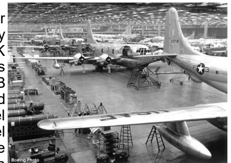
THE EXTERNAL FUEL TANK CAN BE SEEN AS ATTACHED TO OUR "ANGEL OF DELIVERANCE" (52-2718) IN THE BOEING FACTORY IN 1952.

The USAF used the K prefix to identify those aircraft used as air to air refueling tankers. The KC-97's became the first air tankers manufactured by Boeing solely for the specific mission of air to air refueling. Prior to this, all K series airplanes were converted from other roles to air to air tankers such as the B-29 and B-50 which were both bombers, thus becoming the KB-29 and KB-50. Of the 888 KC-97's built by Boeing, 592 were KC-97G's that incorporated all the latest and greatest refinements that included 2 external jettisonable fuel tanks. Each tank, one located under each wing, could hold 691 gallons of fuel and was attached to the wing by a strut. The tank itself was attached to the strut by a Type S-3 bomb rack capable of dropping the tank should there be a need to do so. What is unique about this system is it was designed so each external fuel tank could be replaced with a 4000 pound bomb, one under each wing.