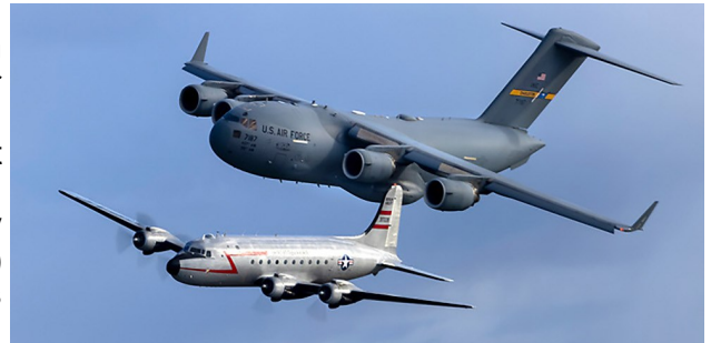
REMEMBERING THE CANDY BOMBER: C-54 “SPIRIT OF FREEDOM” IN FORMATION WITH C-17 “SPIRIT OF THE CANDY BOMBER” OVER UTAH IN 2022.