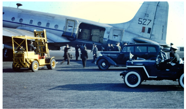
RAF HANDLEY - PAGE HASTINGS BEING UNLOADED AT TEMPELHOF