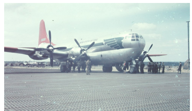
BOEING YC-97A 45-59595