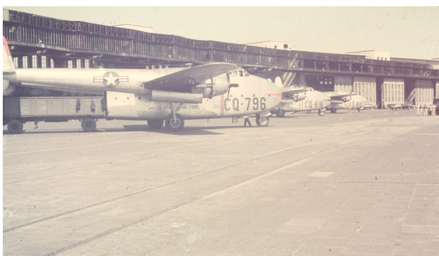
3 OF 5 FAIRCHILD C-82S BEING UNLOADED AT TEMPELHOF. 45-57796, 45-57818, 45-57810