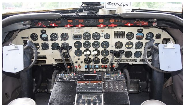
COCKPIT OF C-54D "SPIRIT OF FREEDOM" IN URGENT NEED OF AN AVIONICS UPGRADE.