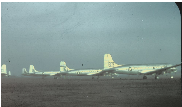
SEVEN DOUGLAS C-54's CAN BE SEEN IN THIS PHOTO