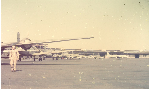
SEVEN DOUGLAS C-54's BEING UNLOADED AT TEMPELHOF