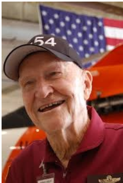
THE BERLIN CANDY BOMBER, GAIL S. HALVORSEN

Following Gail’s ‘Celebration’ we all knew we had to continue with the mission to “Remember, Celebrate and Inspire”. To that end, A/TA, BAHF and CBF are working together to ensure the Spirit of Freedom is a key centerpiece of three upcoming events. The A/TA national board agreed to support financially, and the local A/TA chapters will provide financial plus personnel support for three events in 2025 with more in the future. The first is Joint Base McGuire-Dix-Lakehurst Airshow on 16-18 May 2025. The second is the Scott AFB Open House in Southern Illinois on 13-14 June 2025. Then there is an airshow at Andrews AFB in September at which we also plan to play a key role.