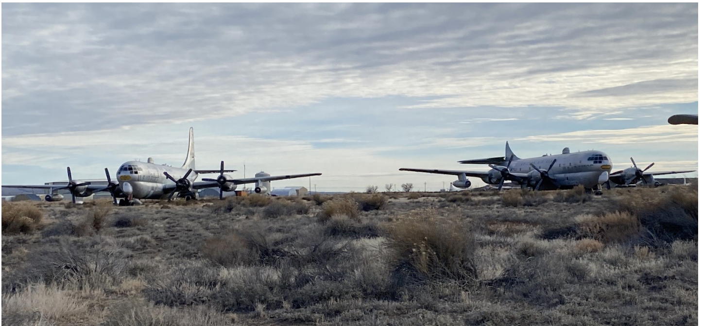
THESE DONATED C-97'S WILL HOPEFULLY KEEP OUR "ANGEL OF DELIVERANCE" AIRWORTHY FOR THE FORESEEABLE FUTURE.