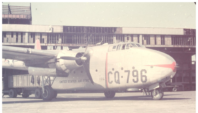
FAIRCHILD C-82 45-57796