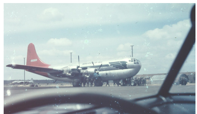
BOEING YC-97A 45-59595