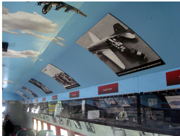
the improvements and new additions to the C-54D on board Berlin Airlift Museum/Exhibits have done just that.

the entire rear of the fuselage interior with graphics of the bleak devastation and carnage as to what Berlin looked like after the allied bombings during the war. Then, upon entering the main cabin thru the Brandenburg Gate will bring them into a new invigorating environment filled with hope as a result of the Berlin Airlift mission to "save a city". Due to the unexpected demanding schedule for the C-54 in 2024, we participated in 18 events involving 30 flights in a 9 month period. As a result, we were unable to devote the time and attention to complete these planned additions and improvements. Hopefully 2025 will allow us to complete these major additions plus a lot more. Despite only a few of the museum/exhibits being incomplete, I am very pleased with the story and history the exhibits tell. The sole purpose and mission of the BAHF organization is to preserve the history and to educate the public about the importance about the great Berlin Airlift of 1948 and 1949. I feel our endeavors with the improvements and new additions to the C-54D on board Berlin Airlift Museum/Exhibits have done just that.