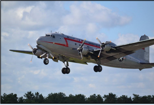
C-54E "Spirit of Freedom"

There are several ways you can support the Foundation's mission of history, education, and remembrance, as well as help keep the C-54, the " Spirit of Freedom " flying and bring the C-97 " Angel of Deliverance " to life.